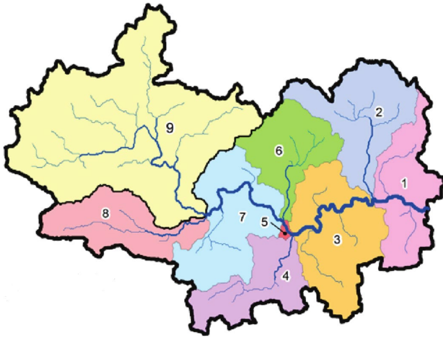
Figure caption: Pfafstetter coding scheme used in HydroATLAS (modified from Technical Documentation of HydroATLAS).

Therefore, we selected 10 basins across the USA for comparison (please see Fig. 9 below). To capture diverse terrain, climate, tectonics, and vegetation conditions as much as possible, these 10 basins are evenly distributed along the east-west direction of the USA. The average absolute relative error of basin areas from these 10 basins in the two databases is less than 0.5%, indicating consistency between the two databases in delineating basin boundaries.