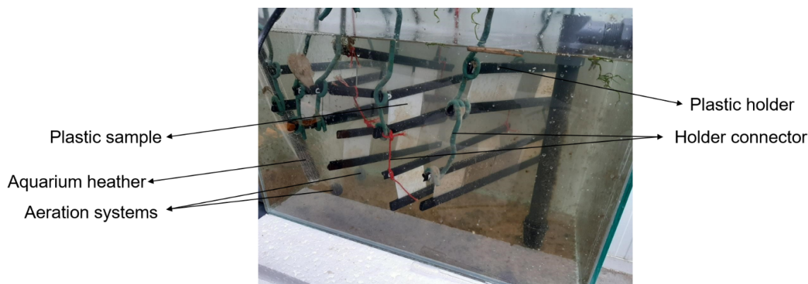
Figure 1. Aquarium setup for biofilm growth on pristine plastic specimens.

oven for 4 d at 60^{\circ}\text{C} , and was afterward manually crushed using a mortar and stored in the dark until further use. To add the crushed sediment into the tank, before any measurements, the tank metal impeller was activated for 1.5 min to allow the sediment to stay in suspension in the water. This action was repeated approximately every 30 min to maintain the sediment in suspension. The actual concentration of sediment added to the tank was measured by Flanders Hydraulics. The suspended sediment concentration (SSC) was determined gravimetrically, after filtration of the sample through a filter with a pore size of 0.45\ \mu\text{m} and drying at a temperature of 105^{\circ}\text{C} . The results showed a low concentration of sediment of 4\ \text{mg L}^{-1} and a higher concentration of 16\ \text{mg L}^{-1} .