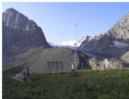
Figure 3: Station GOLU with snow system

The station outline is determined by the selection of meteorological sensors and can be differentiated into two types. The first type consists of a set of separate sensors complying with the WMO requirements (WMO, 2018) that are arranged around the station main box to