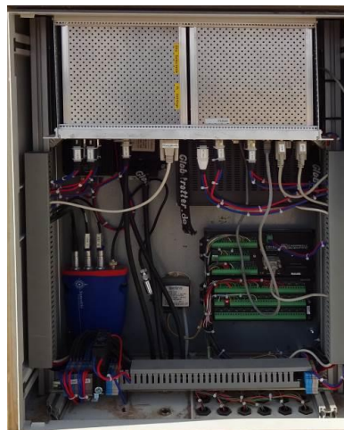
Figure 6: Station main box. Topside the computer and power module is visible. The VSAT and iridium modem are located in the back. Below is the GNSS receiver (left), the barometric sensor (middle) and the Campbell® datalogger (Schöne et al., 2013).

The primary service of the CAWa ROMPS network is to provide meteorological and hydrological data (Schöne et al., 2018b and 2019), especially from the high mountain areas of Central Asia supporting the national Hydrometeorological services and the regional and international scientific community. Additional to the hydrometeorological data acquisition, 140 some stations integrate other sensors, such as broadband seismometers for the GEOFON network (GEOFON, 2020), automated cameras for glacier monitoring and mass balance calculations (Hoelzle et al., 2017), GNSS receivers for investigation of glacier dynamics and Glacier Lake Outburst Flood (GLOF) monitoring (Zech et al., 2016 and 2018) or