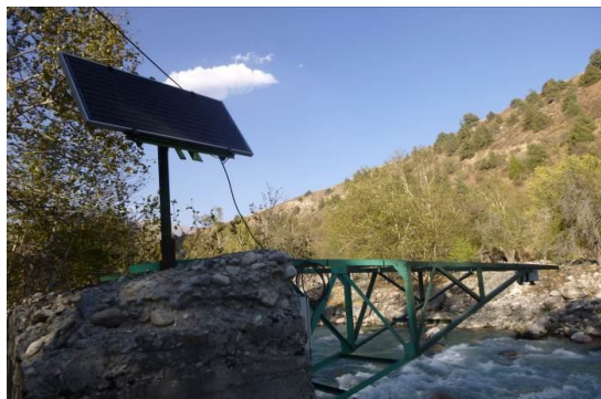
Figure 5: River discharge system at station MTAL with a solar panel and the boom for the sensor.