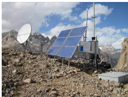
Figure 2: Station ABRA

The stations are designed for the operation in remote areas and high altitudes (see Figure 2 and Figure 3), especially under extreme climate conditions with temperatures ranging from +60°C to -60°C (Schöne et al., 2013). To keep the maintenance efforts low, the general technical setup of all ROMPS is identical at most locations. The system operates independently and automatically in order to reduce the need for manual interventions of a local operator. All stations consist of outside connected sensors and a water-proof (IP66) station main box (see Figure 6) integrating the central electronic components for the general operation such as the station computer system, independent (solar) power supply, and data communication systems. Two alternative communication lines were chosen, either two different satellite systems (VSAT and Iridium) or depending on the signal coverage one satellite (VSAT) and one GSM ground communication line. Due to their independence from local infrastructures (power, data transmission and manual interaction), the stations can be located in remote areas with difficult accessibility.