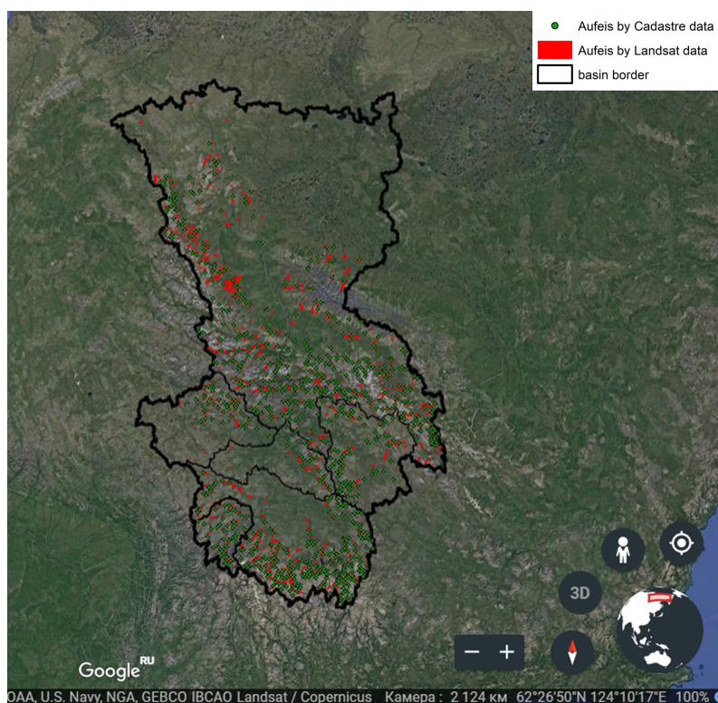
Fig. 1. Google Earth aufeis database overview