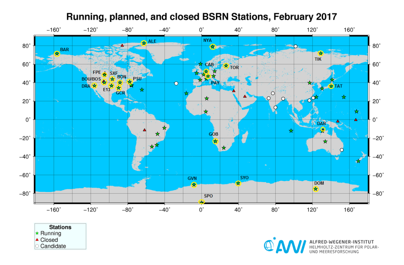
Figure 1. Active (green star) and closed (red triangle) BSRN stations. Stations that measure both upward and downward radiative fluxes are circled with yellow and labelled with their BSRN abbreviation. White: BSRN candidate stations.