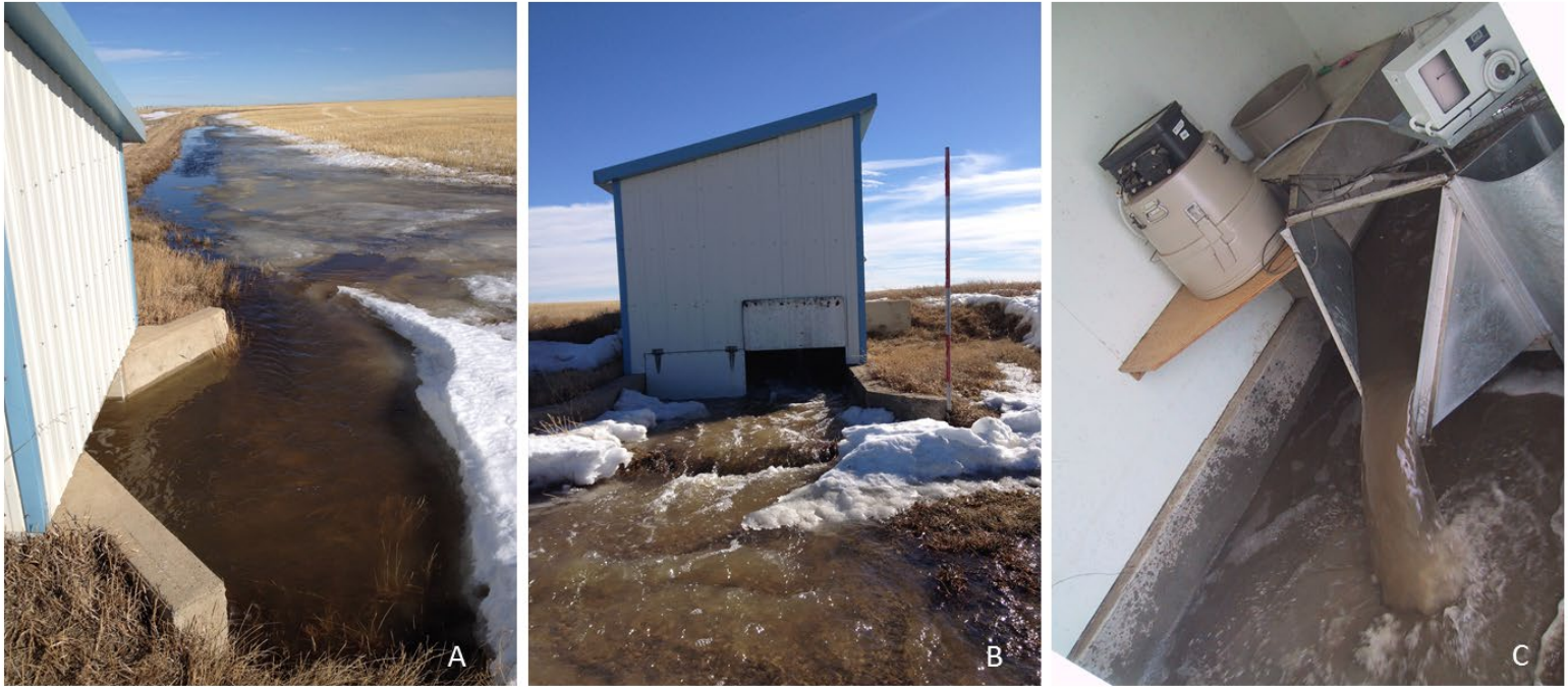
Figure 3. Photographs of the runoff shed at Hillslope 2. A) Facing east, at the inflow side of the shed (taken March 2014). B) Facing south, at the outflow side of the shed (taken March 2014). C) Inside the shed, showing a 0.61m H flume, a Stevens water level chart recorder, and an automated ISCO 3700 Portable Sampler.