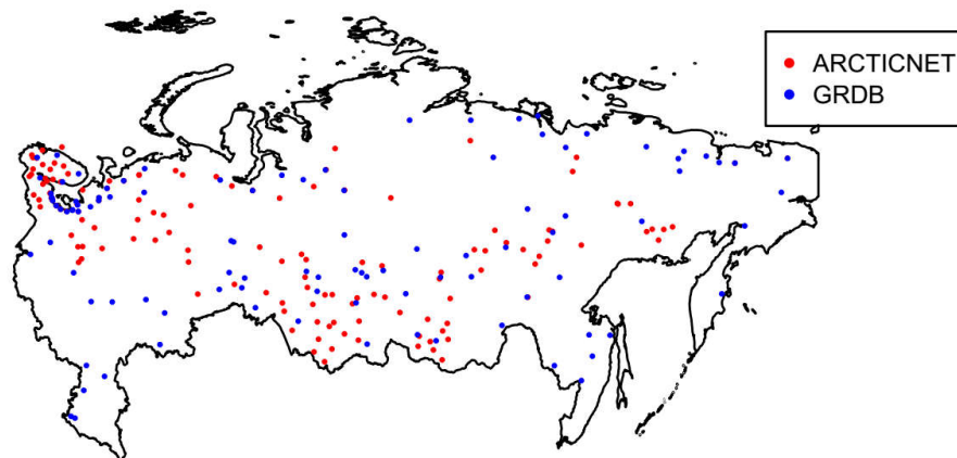
Figure 1. Available stations in Russia. Red dots represent ARCTICNET database (139 stations). Blue dots represents GRDB (the Global Runoff Data Base) stations with daily record greater than 10 years (102 stations). GRDB stations were plotted on top of ARCTICNET stations.