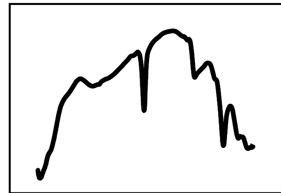
Spectrum name: Sample X_spot number